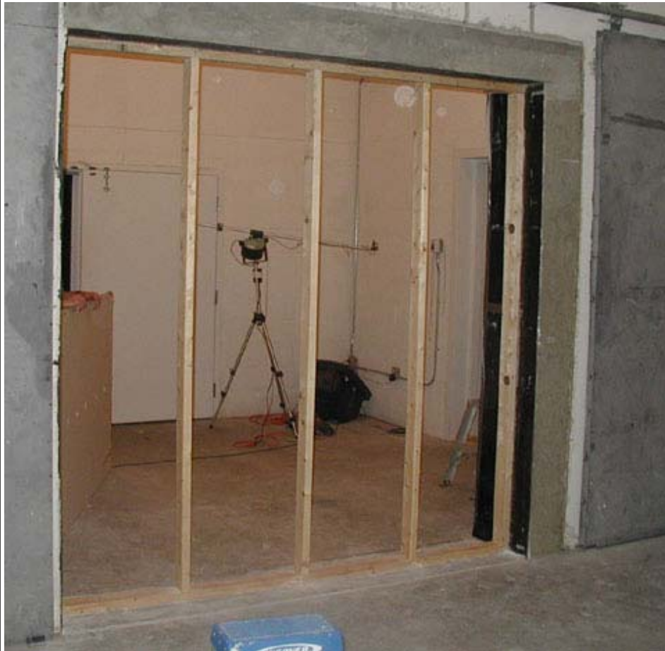
Figure 2: Wood-stud Specimen Frame in Opening

The specimen arrived at the laboratory still mounted on the wood stud frames. Fastener heads on the base layer panel were accessible via pre-drilled holes through the face layer, approximately 1/2" in diameter. A new wood-stud frame was erected in the specimen opening. The glued wall panels were demounted from the drying frames, and then remounted on the frame in the opening. Fastener spacing on the face layer of sheeting was irregular, but averaged to approximately 8" on-center.