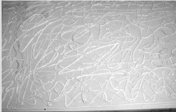
Figure 1: Typical Green Glue Random Application Pattern

The gypsum board panels were laminated together with green glue. The client reported that the green glue was applied from adhesive cartridges in 3/16" beads in a random pattern over the whole panel. The aging period was over 40 days, greater than the 14 days period stated in ASTM Standard E90 for water-base adhesives. The assemblies were dried on 4' x 8' wood-stud frames, spaced out and with forced air ventilation according to the client.