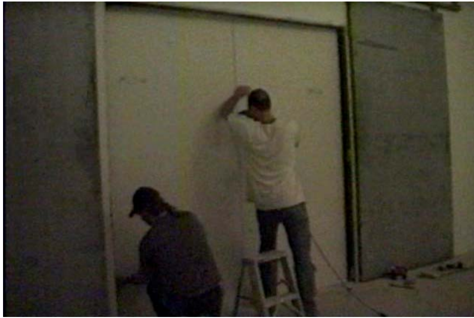
Figure 2: Specimen Installation

The same contractor returned to build the 24" O.C. 2x4 wood stud frame and install the wall assembly in the laboratory specimen opening. Fabricated panel sandwiches were weighed just before fastening to the frame. Individual components of the sandwich are listed separately; weights for the entire sandwich are shown on one line of the assembly description.