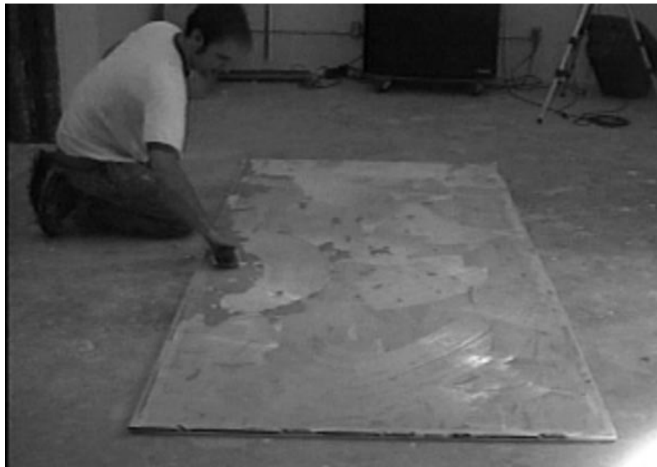
Figure 1: Glue Application

Independent contractors purchased the visco-elastic damping glue directly from the glue’s manufacturer and fabricated the wall panel sheeting in the laboratory work area to cure. The glue was troweled on with 1/8" v-notch trowel. Each fabricated panel was thoroughly and methodically compressed by walking on the freshly constructed sandwiches. The aging period was 14 days. The assemblies were dried at room temperature in a stack with 2x4 spacers and forced-air ventilation.